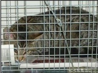
Community cat at the vet ready for spaying.

“Cats have previously been helped in this area but only when budgets allowed or when personal donations by Lisa herself or other volunteers were made to help these animals get spayed!”