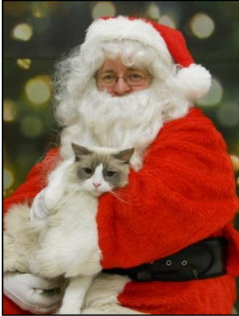
Photo with Santa Claws

"Mark your calendar for Saturday, February 23, 2013 for our "Fun Bowling Night"."