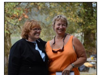
Fun at the Walk-a-thon.