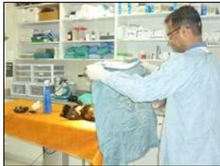
The first community cat being spayed with funds from the Langley Kinsmen.

Once again, thank you, Langley Kinsmen for your support. Without your generous donation, these cats would not have been helped and many more unwanted kittens would have been born.